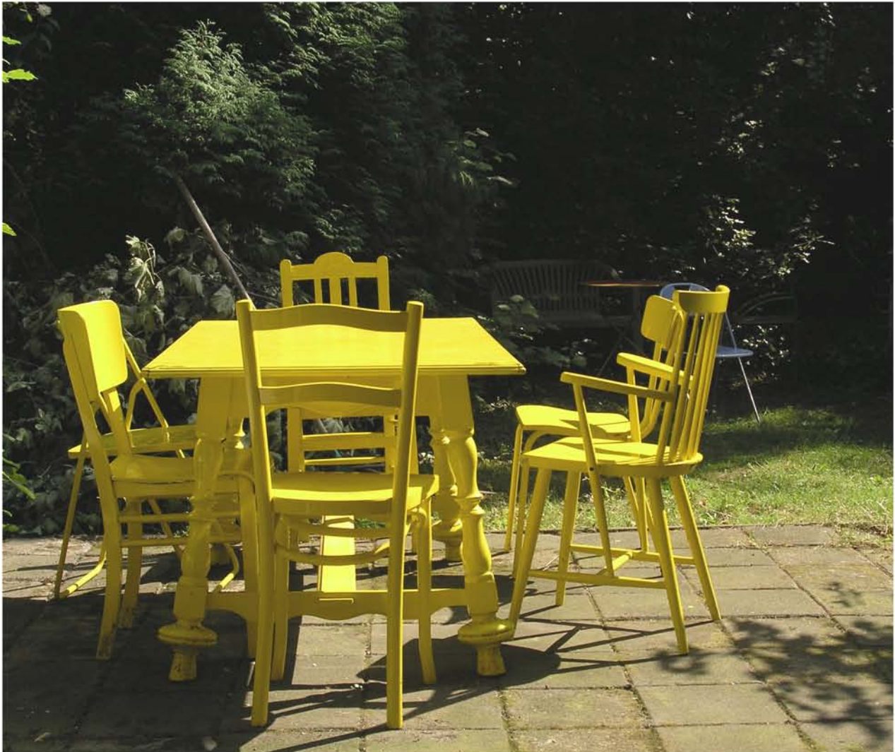
Amsterdam, 2005. “ Yellow in the garden “.