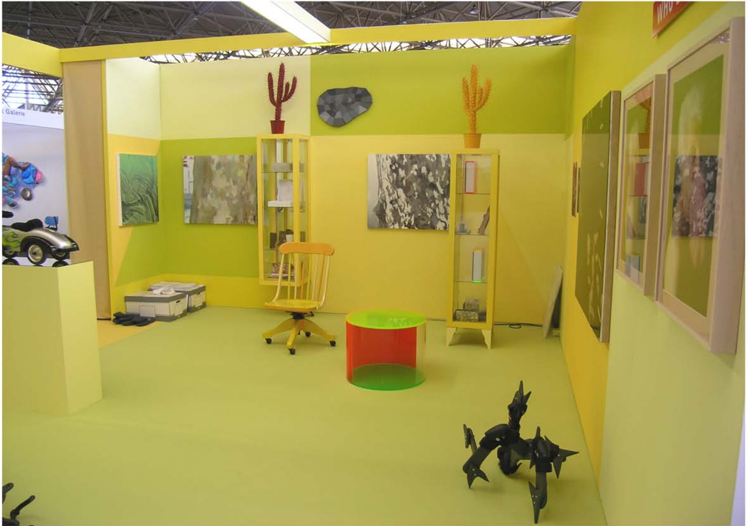
“ Stand n.3 “, courtesy Galerie In Situ, Kunstrai artfair, 2006, Amsterdam (NL)..