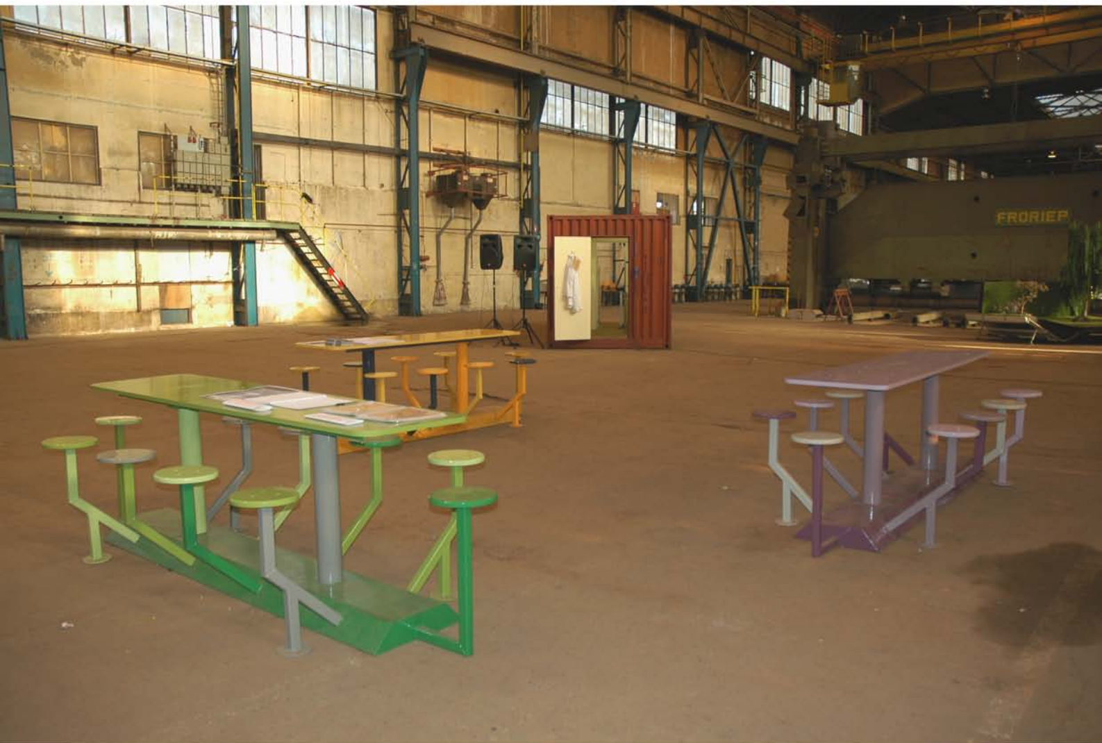
‘ Anonymous design ’, Mijn domein – binnen is niet buiten ’, 2005, Vlissingen (NL)