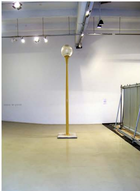
15 eme bourse d'Art Monumentale de la ville d'Ivry, 2005, Ivry (F) " Dustbin to use ", " Bench to use ", " Urinoir to use ". City furniture from Ivry.