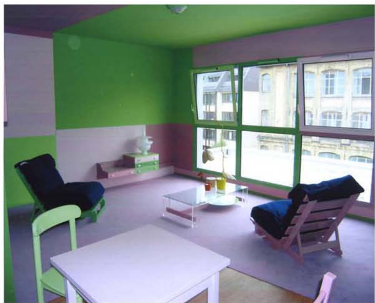
'The flat', Art Decoratifs school commission, 2005, Strasbourg (F)