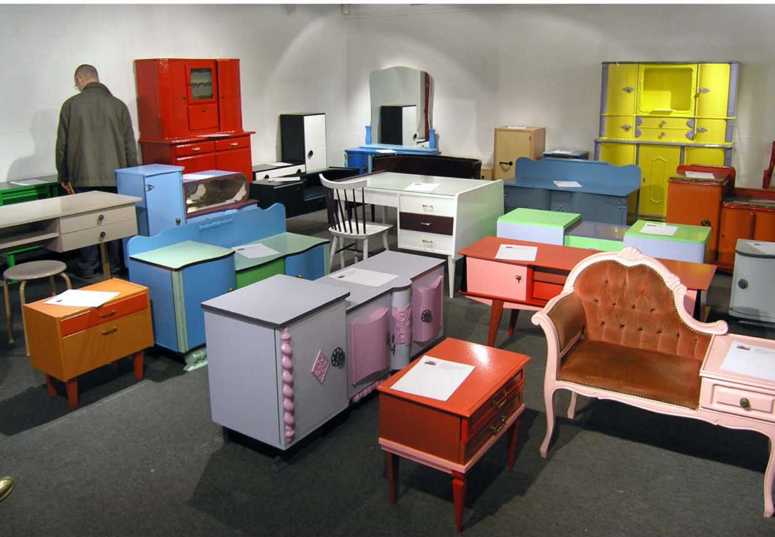
“ Spit collection 2004 “, Maison de la culture, 2004, Tournai (B) System: The Spit collection was auctioned during the time of the exhibition. On each painting was a paper that you could be filled in with name, telephone and auction price. For this project, my position as an artist is to be the intermidiar between a second hand enterprise and a cultural place.