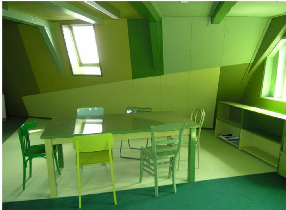
New office Droog Design, commissioned by Droog Design, 2004, Amsterdam (NL) 350 m 2 to paint, 7 months process. Different color systems.