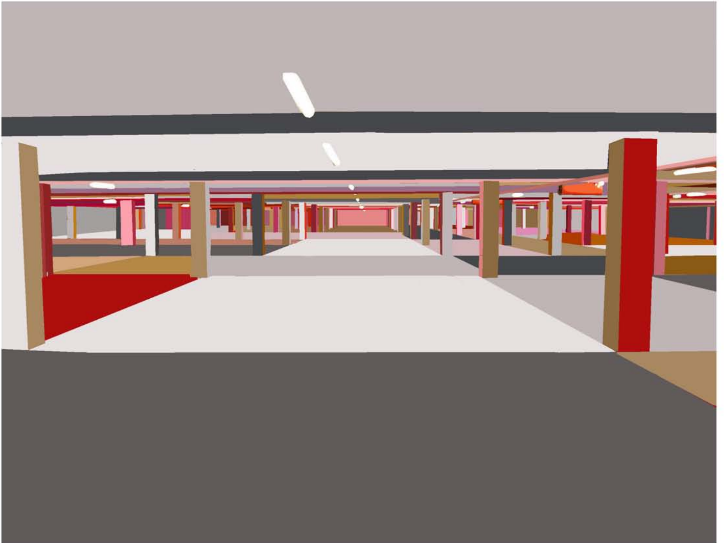
“ The parking “, project ING Bank, 2006, Amsterdam (NL).