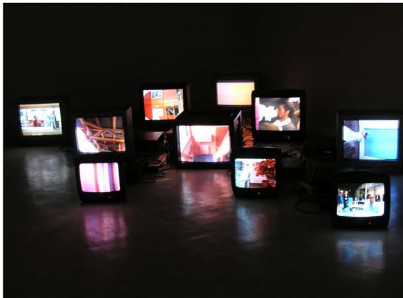
15 eme bourse d'Art Monumentale de la ville d'Ivry, 2005, Ivry (F) On the top to bottom "Peinture secrète" "10 reportages sur 10 projets passés"