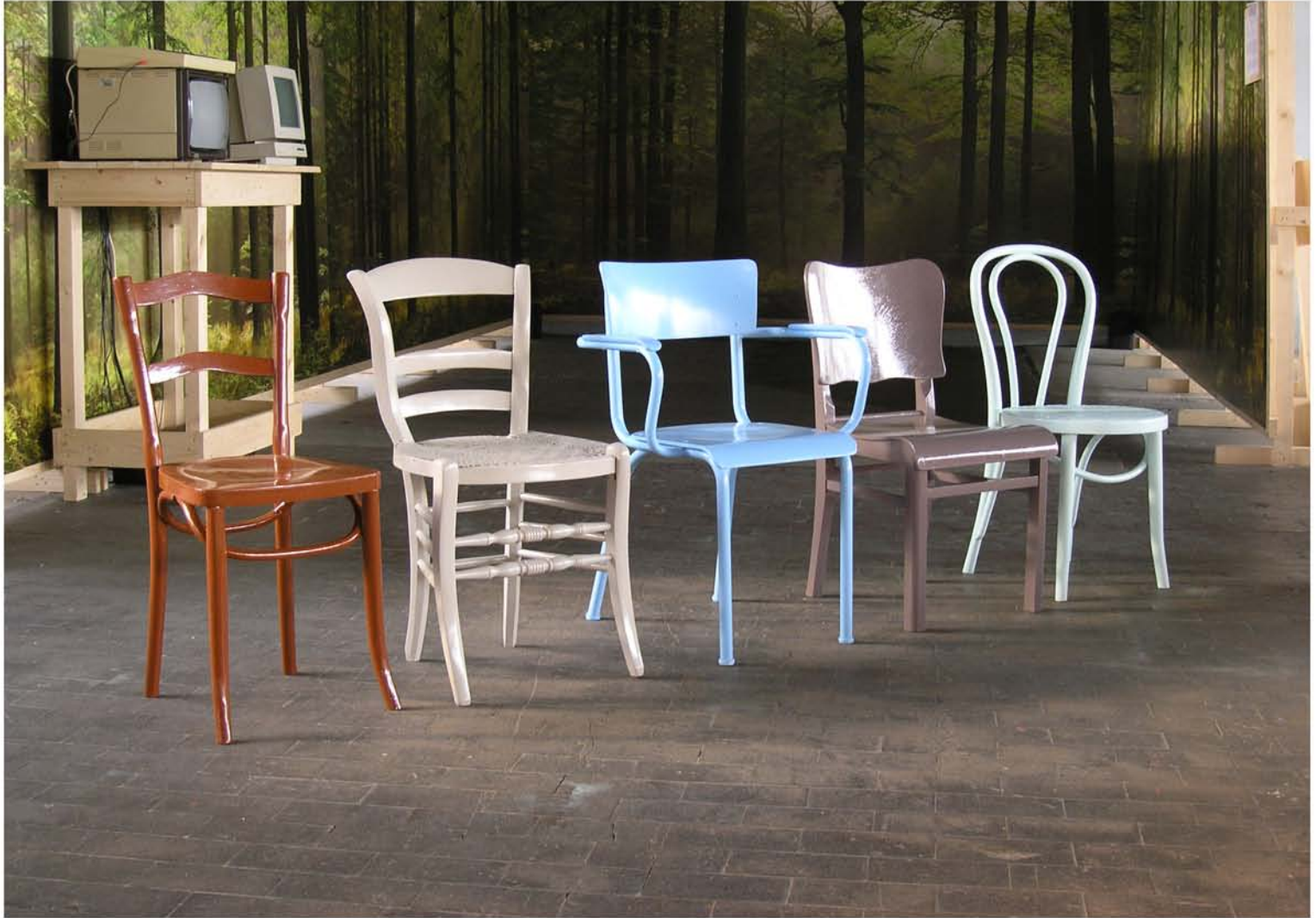
Open Borders, Lille 2004 (F), 4 chairs