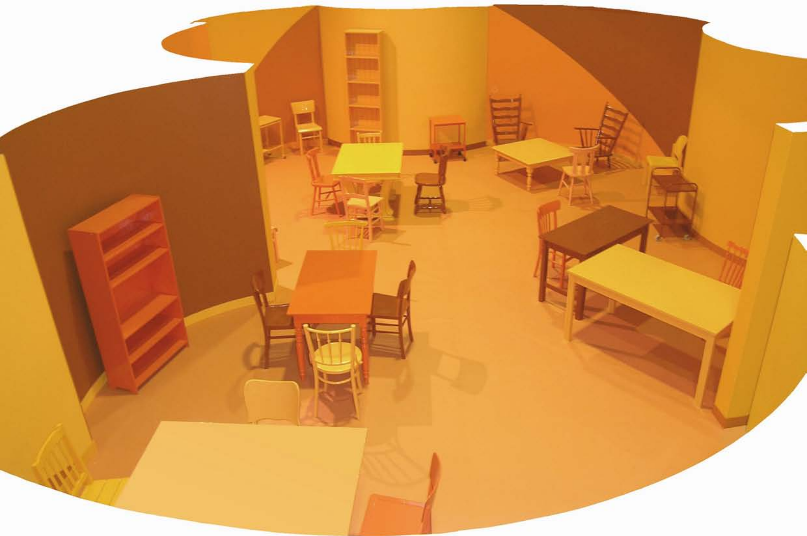
Affinites exhibition, 2005, Salines d'Arc et Senans (F) "The library".