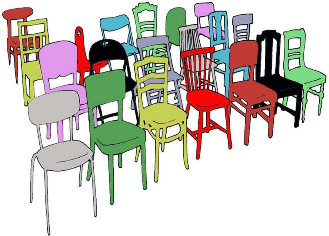
“ Chair collection “, Fond National d’Art Contemporain (FNAC), Paris (F)