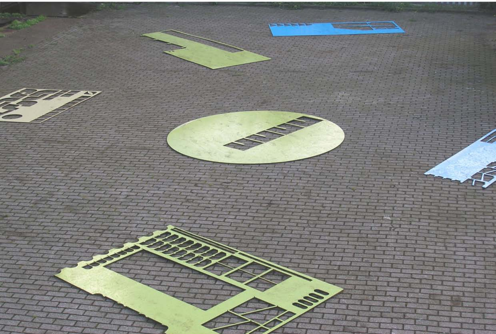
“Anonymous design”, Mijn domein – binnen is niet buiten ’, 2005, Vlissingen (NL)