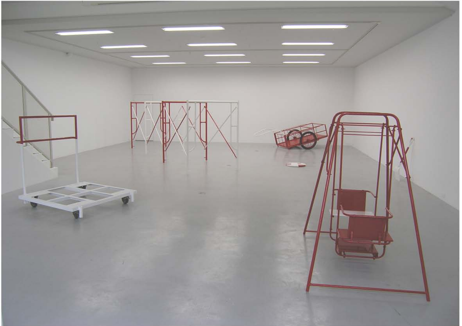
"Restauration of the daily life", Art & Design University, 2006, Nagaokakyo (J) Material coming from the university itself. A bike, a table and some other objects were painted directly on location, outside of the gallery.