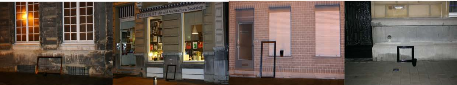
'The stand', Lineart art fair, 2005, Galerie In Situ, Gand ( Gent ) (B) I asked my gallerist to distribute on random in the city some still-lives after the show