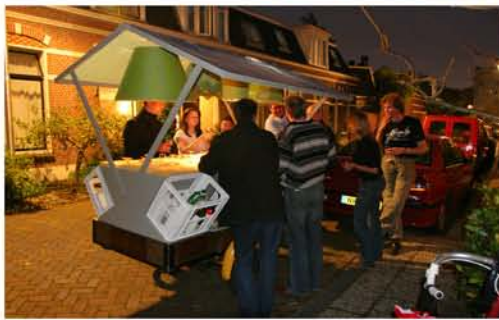
“ 100 private / prive openings – 500 painted glasses to offer “, action 3 days, 2005, Leeuwarden (NL)