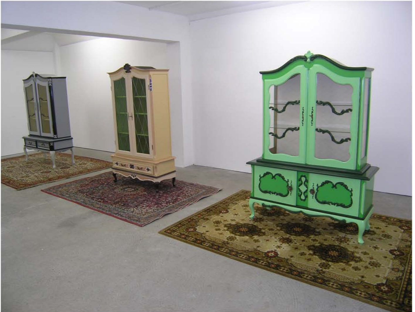
“ Spit collection “, Ram Foundation, 2004, Rotterdam (NL)