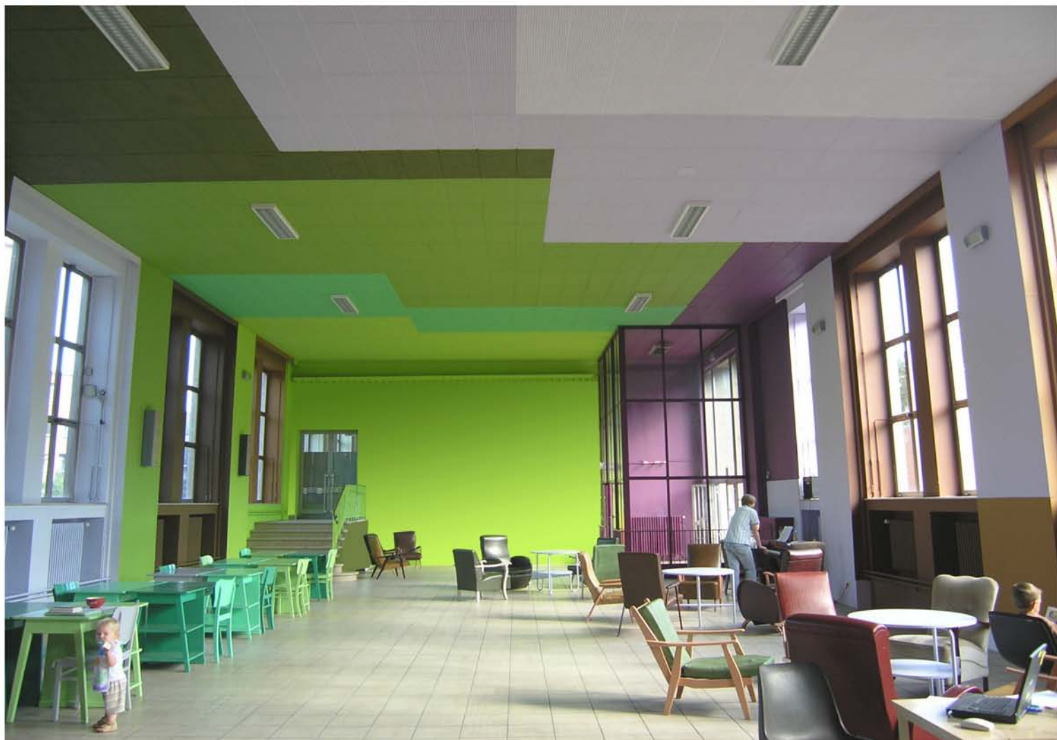
Artist in residence. Second chance school, 2004, Leuven (B) I used the color theory with colors picked on lign from number 69 to 80.