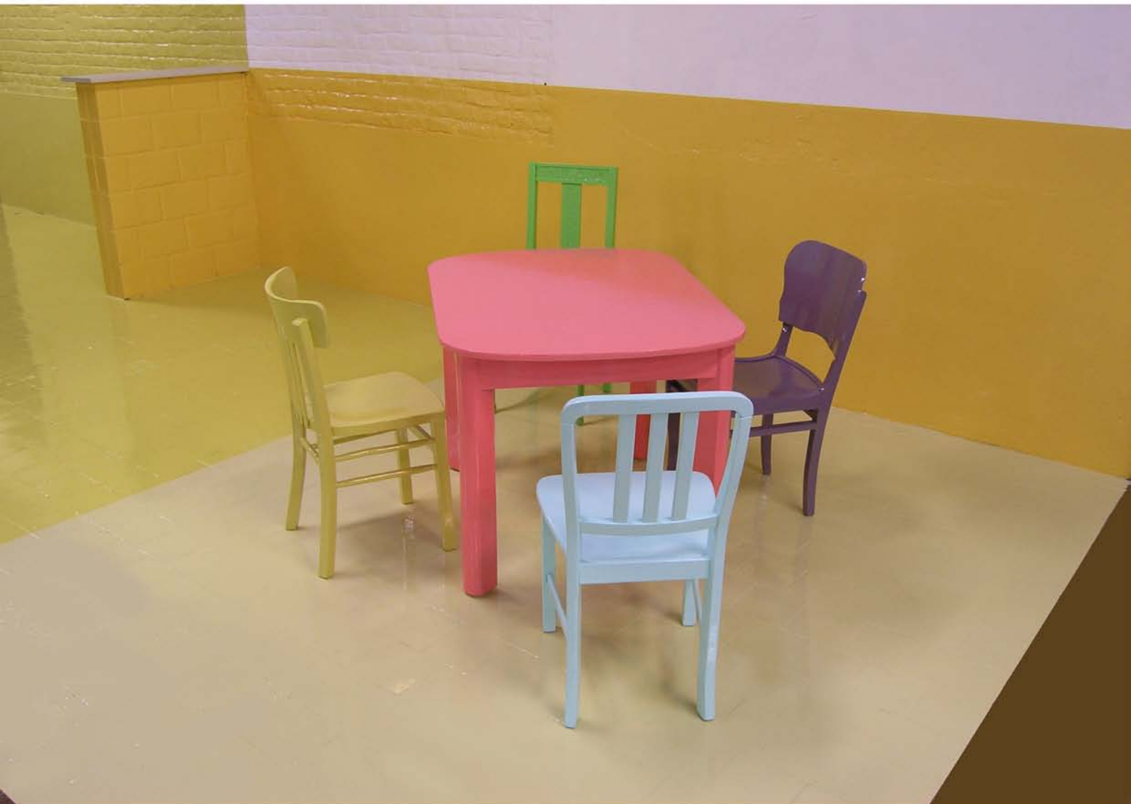
'Gekleurde Vormgeving', Aalst (B). curator Jan de Nys. 'Tryptique 2, the bar', installation in Sleutelstraat 3. detail