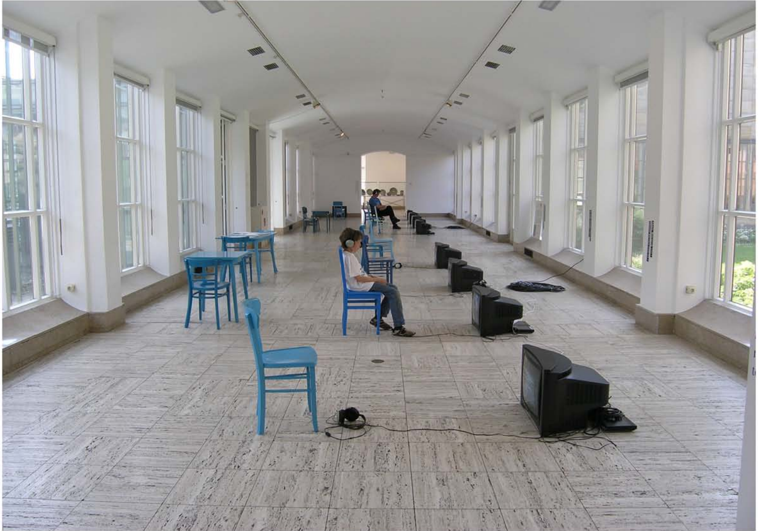
“ The art installation “, Boymans Museum, 2006, Rotterdam (NL). See explanations picture 112.