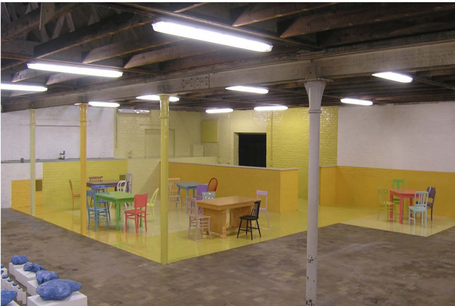
'Gekleurde Vormgeving', Aalst (B). curator Jan de Nys. 'Tryptique 2, the bar', installation in Sleutelstraat 3.