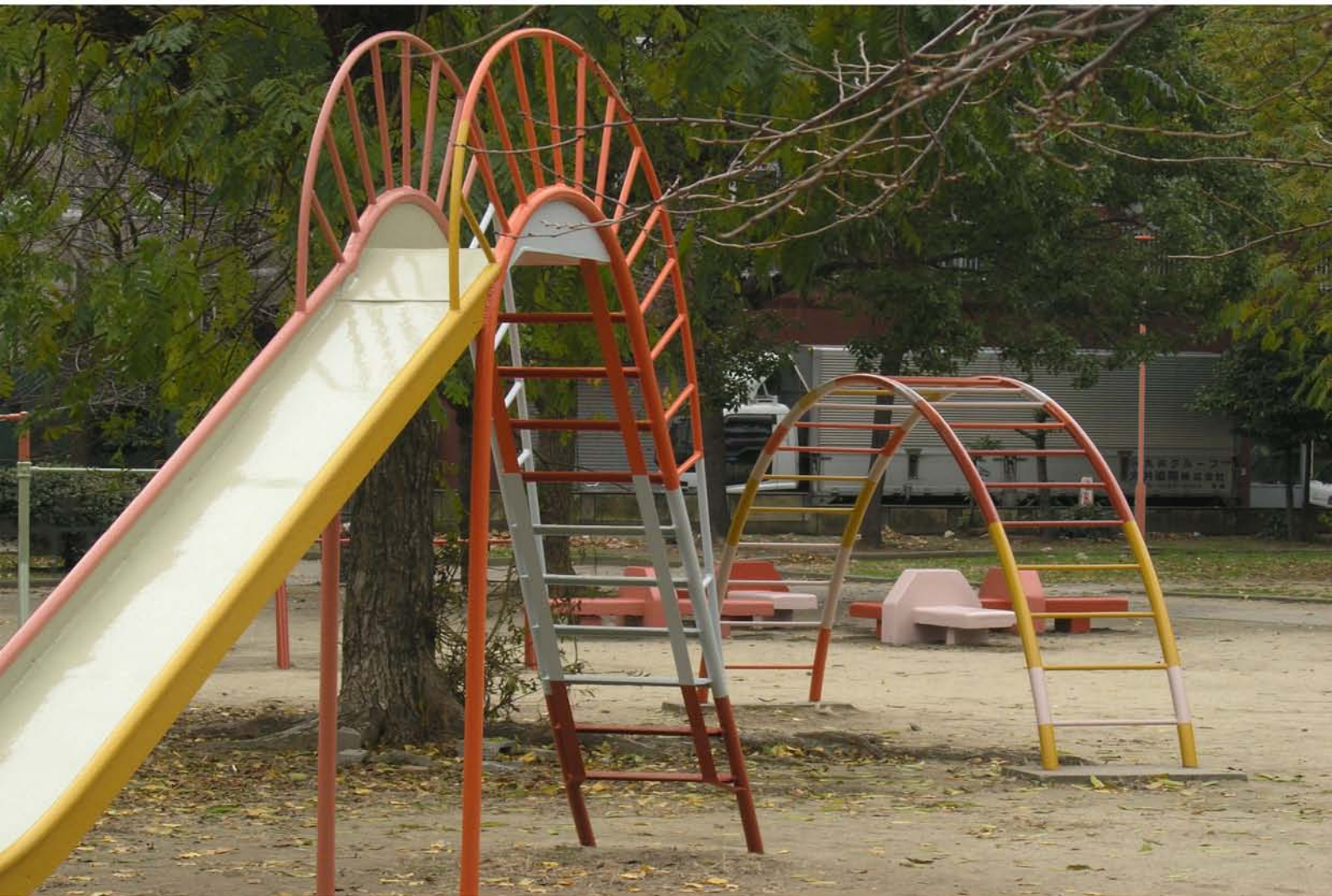
“ The park “ public park, 2006’, Osaka (J) Detail.