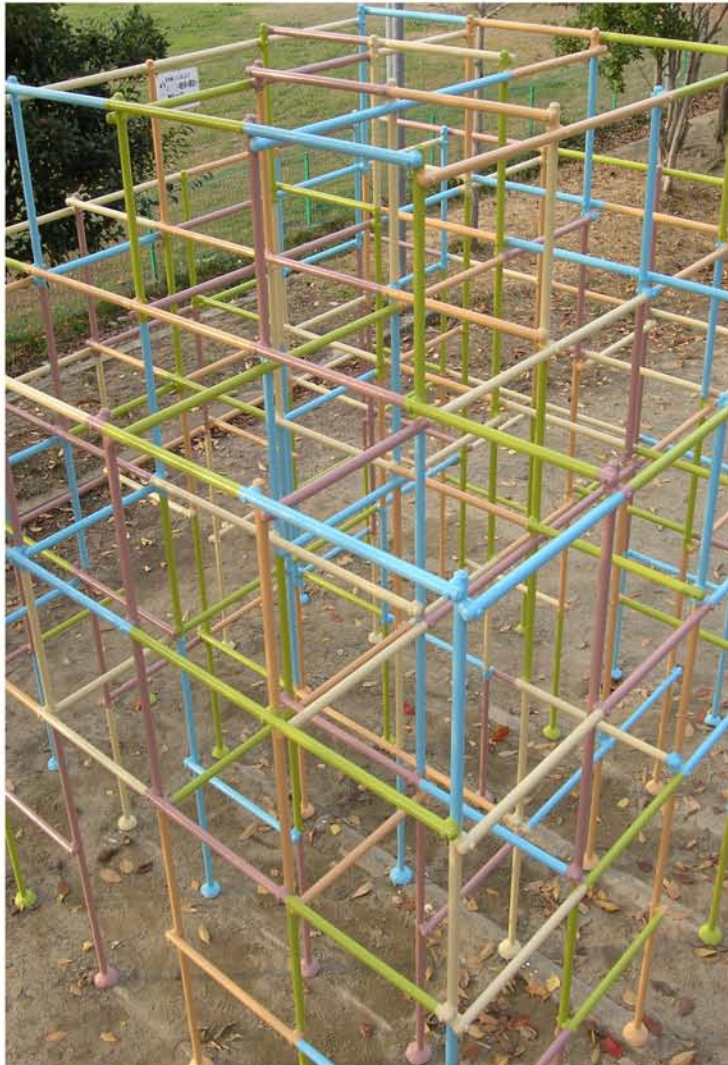
“ The park “, public park, 2006, Nagaokakyo (J) Detail.