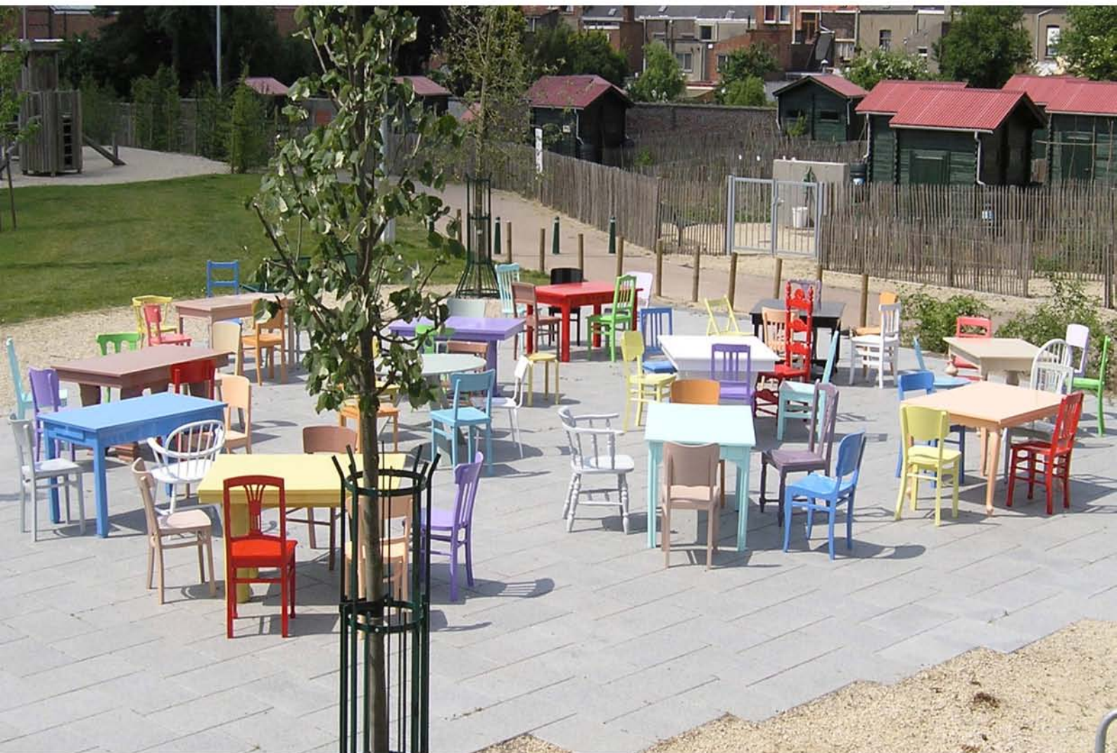
' Tryptique 3, the terrasse ', installation, place Ste Elysabeth.