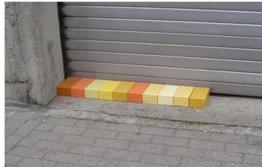
' Street sculptures ', routing made out of 7 painted sculptures realised with mass produced concrete volumes from the city technical services..